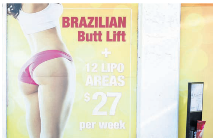
A window display advertises low-cost "Brazilian butt lift" cosmetic surgery procedures outside a clinic in Miami on Friday, March 22, 2019.